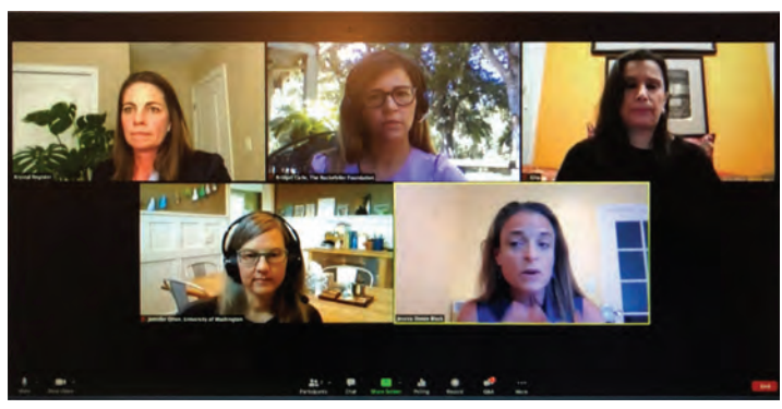
Panel on Nutrition Security.

Expanding nutrition security for all will depend on the food system stakeholders' collective ability to educate, empower and motivate individuals and communities based on the needs that those individuals and communities identify and prioritize for themselves. Cooking and food preparation at home have been in a state of decline for decades for a variety of reasons, including the sometimes generational experience of