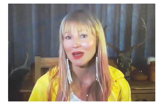
Jewel, Grammy-nominated singersongwriter and mental health advocate

security for all. The Fifth Annual Foodscape Innovation Summit, held on June 18, 2020, focused on nutrition security, related disparities and inequities, and the impact of the COVID-19 pandemic, as well as innovation aimed towards a healthier food ecosystem. Award-winning singer/songwriter, Jewel, shared her personal journey from homelessness to well-being through song and meditation. Participants returned on July 9, 2020 to participate in breakout groups that explored the potential to harness knowledge gained from the current public health crisis to strengthen the health focus of the food ecosystem equitably.