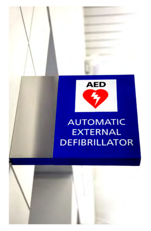
AEDs are typically placed in public areas where large numbers of people gather. Their locations should be clearly marked for quick access.

The American Heart Association offers CPR and AED training through training centers. To locate a training center near you, call your nearest AHA office or 1-877-AHA-4CPR (1-877-242-4277). You may also visit heart.org/CPR.