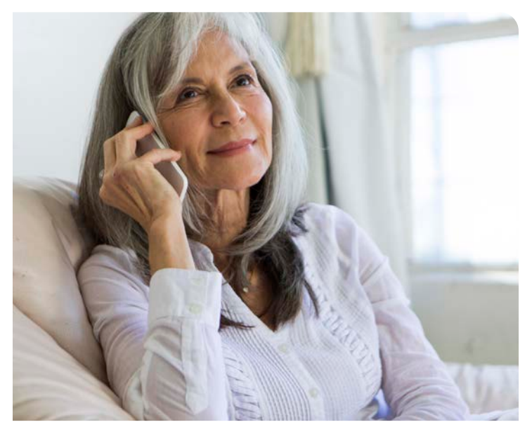
If you have an ICD, hold your cell phone to the ear on the side of your body opposite from your ICD.

Research has shown that ICDs can extend life and improve quality of life. You may feel less anxious living with an ICD by understanding more about the device itself and what to expect from having it.