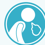
SHORT OF BREATH